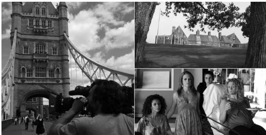
LEFT Superflood BOTTOM RIGHT G Spot