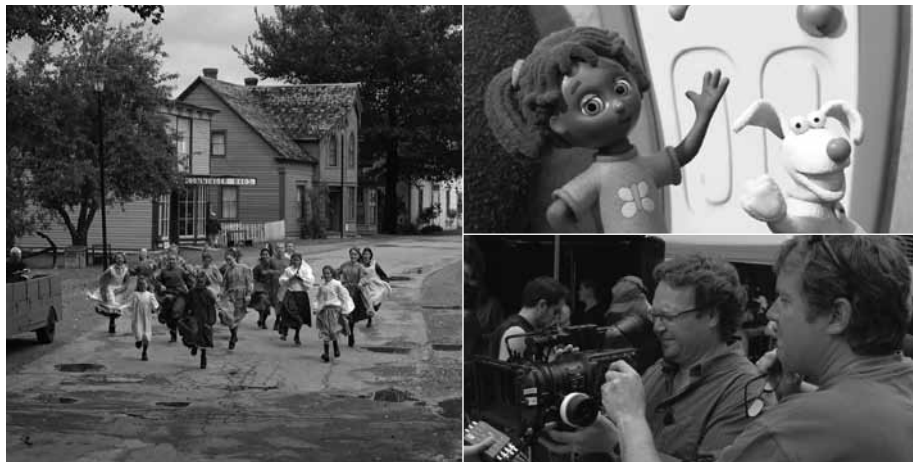
TOP RIGHT POKO BOTTOM RIGHT Matters of Life and Dating

DESCRIPTION Mercury Awards, Mobius Awards, London International Advertising Awards, DragonFest.